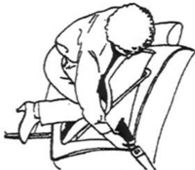
To make your child's safety seat secure, push down on it while you tighten the belt.