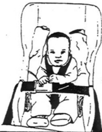
A new baby needs support. Put rolled up towels on each side, not under the infant.