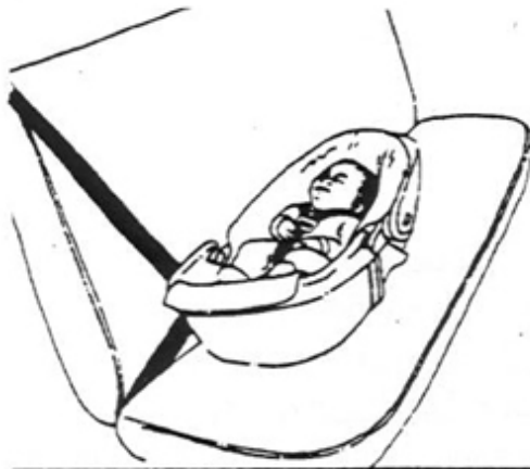
In this car bed a newborn baby can ride lying flat. This product converts to a rear-facing seat.