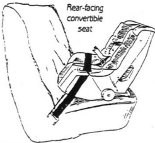
Infants less than 1 year, over 20 lbs. ride in a seat approved for heavier infants rear facing.