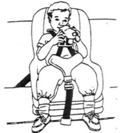
After 1 year and at least 20 lbs.